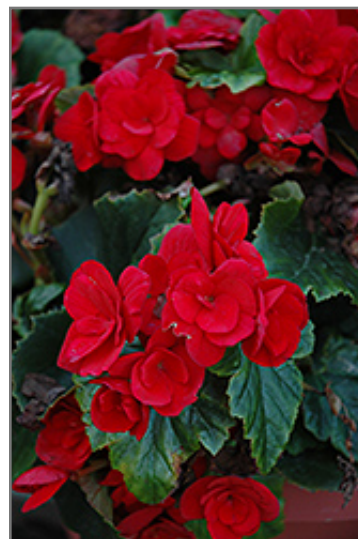
Baladin Begonia flowers

Baladin Begonia is recommended for the following landscape applications;