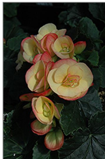
Pink Chablis Begonia flowers

Pink Chablis Begonia is recommended for the following landscape applications;