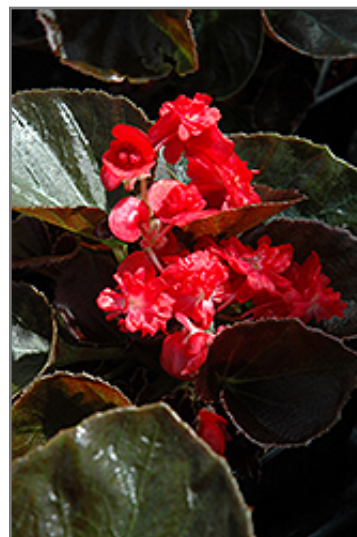
Doublet Red Begonia flowers