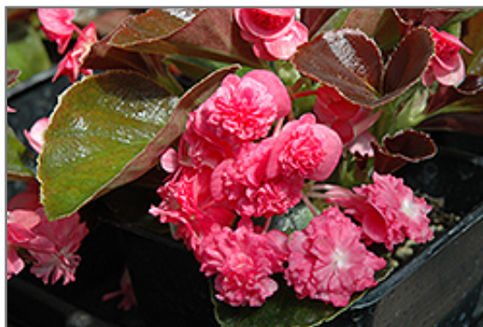
Doublet Rose Begonia flowers