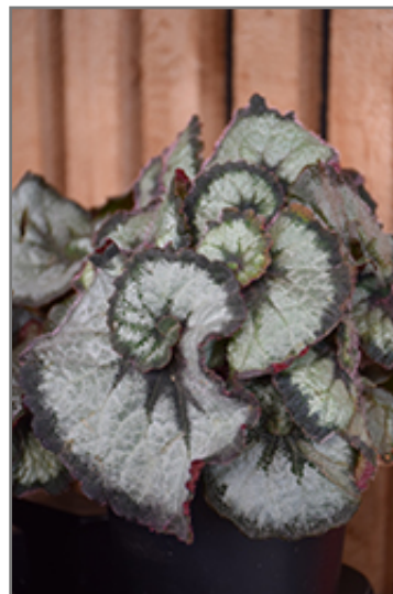
Escargot Begonia foliage