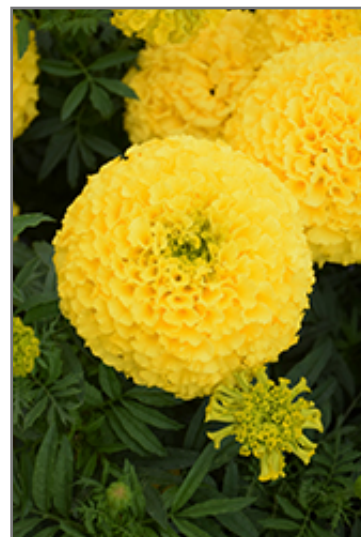
Marvel Yellow Marigold flowers

Marvel Yellow Marigold is recommended for the following landscape applications;