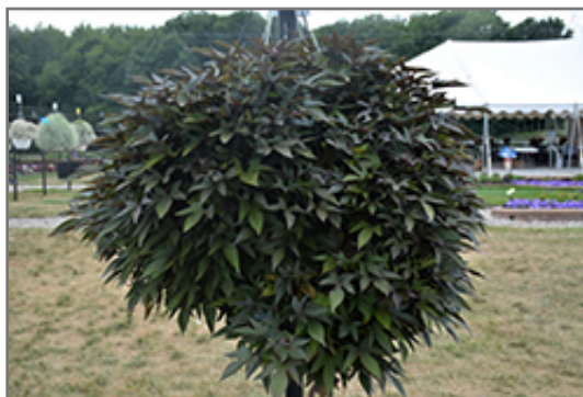
Sidekick Black Sweet Potato Vine