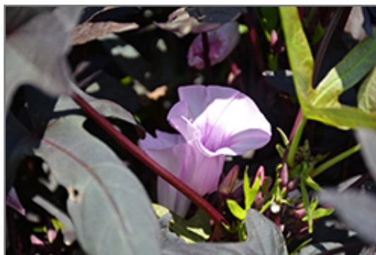
Sidekick Black Sweet Potato Vine flowers

Sidekick Black Sweet Potato Vine is a fine choice for the garden, but it is also a good selection for planting in outdoor containers and hanging baskets. Because of its trailing habit of growth, it is ideally suited for use as a 'spiller' in the 'spiller-thriller-filler' container combination; plant it near the edges where it can spill gracefully over the pot. Note that when growing plants in outdoor containers and baskets, they may require more frequent waterings than they would in the yard or garden.