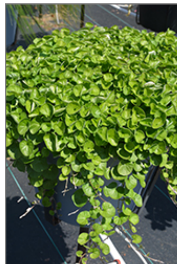
Emerald Falls Dichondra foliage

Emerald Falls Dichondra is a fine choice for the garden, but it is also a good selection for planting in outdoor containers and hanging baskets. Because of its trailing habit of growth, it is ideally suited for use as a 'spiller' in the 'spiller-thriller-filler' container combination; plant it near the edges where it can spill gracefully over the pot. Note that when growing plants in outdoor containers and baskets, they may require more frequent waterings than they would in the yard or garden.