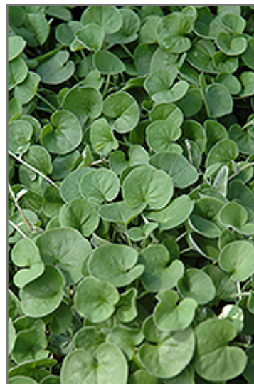
Emerald Falls Dichondra foliage