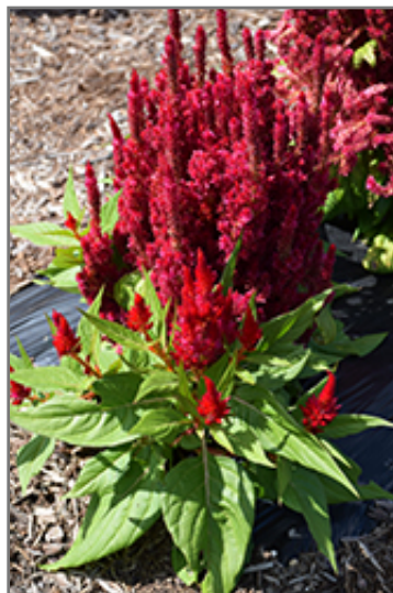
Fresh Look Red Celosia in bloom