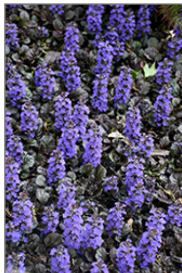
Black Scallop Bugleweed flowers