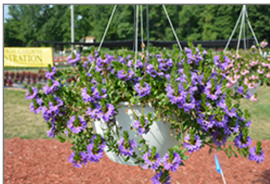
Bombay Dark Blue Fan Flower in bloom