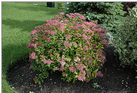
Goldflame Spirea in bloom