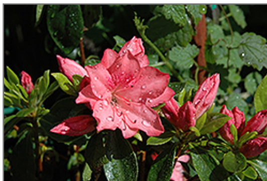
Girard's Renee Michelle Azalea flowers

Girard's Renee Michelle Azalea will grow to be about 3 feet tall at maturity, with a spread of 5 feet. It tends to be a little leggy, with a typical clearance of 1 foot from the ground. It grows at a slow rate, and under ideal conditions can be expected to live for 40 years or more.