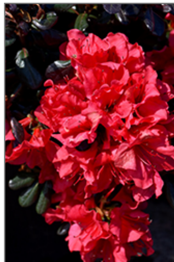
Johanna Azalea flowers