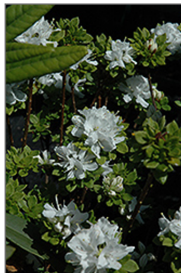
White Kyushu Azalea flowers

White Kyushu Azalea will grow to be about 3 feet tall at maturity, with a spread of 3 feet. It tends to be a little leggy, with a typical clearance of 1 foot from the ground. It grows at a slow rate, and under ideal conditions can be expected to live for 40 years or more.