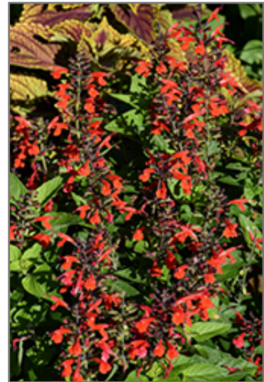
Forest Fire Sage flowers

Forest Fire Sage is recommended for the following landscape applications;