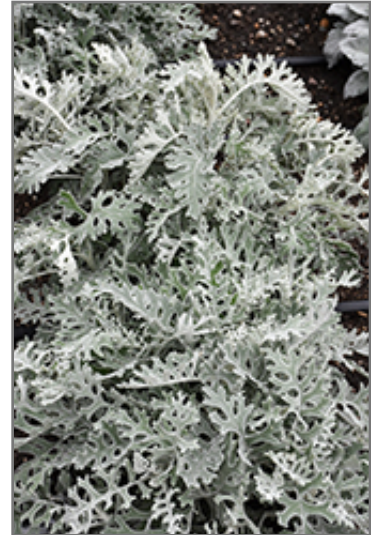
Silver Dust Dusty Miller foliage

Silver Dust Dusty Miller is a fine choice for the garden, but it is also a good selection for planting in outdoor containers and hanging baskets. It is often used as a 'filler' in the 'spiller-thriller-filler' container combination, providing a mass of flowers and foliage against which the larger thriller plants stand out. Note that when growing plants in outdoor containers and baskets, they may require more frequent waterings than they would in the yard or garden.