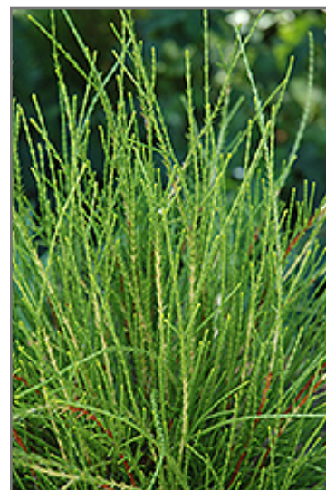
Franky Boy Arborvitae foliage