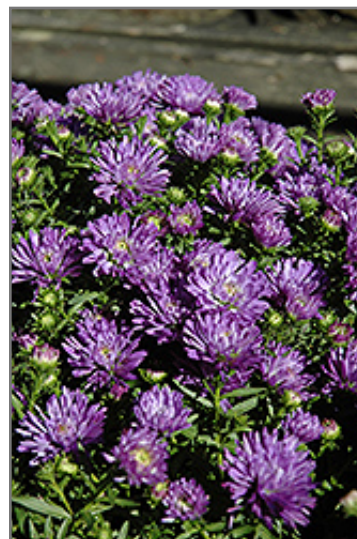
Blue Henry Aster flowers