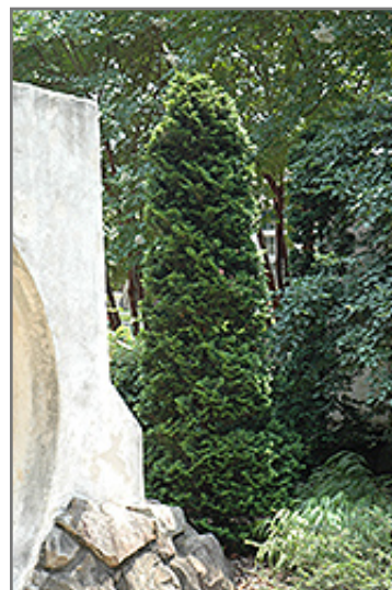
Dark Green Arborvitae

Dark Green Arborvitae will grow to be about 20 feet tall at maturity, with a spread of 7 feet. It has a low canopy with a typical clearance of 1 foot from the ground, and is suitable for planting under power lines. It grows at a slow rate, and under ideal conditions can be expected to live for 50 years or more.