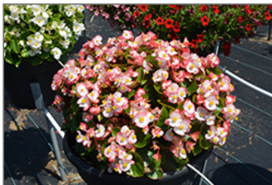
Super Olympia Bicolor Begonia in bloom