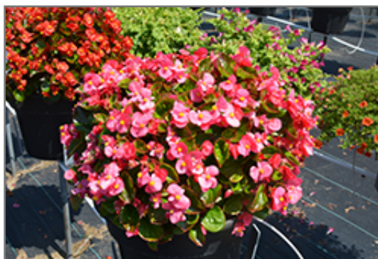
Super Olympia Rose Begonia in bloom