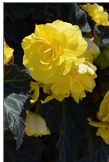
Nonstop Mocca Yellow Begonia flowers