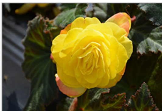
Nonstop Mocca Yellow Begonia flowers