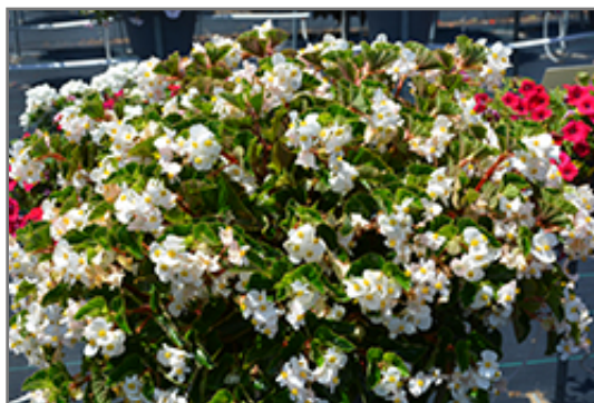
BabyWing White Begonia in bloom

BabyWing White Begonia is a fine choice for the garden, but it is also a good selection for planting in outdoor containers and hanging baskets. It is often used as a 'filler' in the 'spiller-thriller-filler' container combination, providing a mass of flowers and foliage against which the thriller plants stand out. Note that when growing plants in outdoor containers and baskets, they may require more frequent waterings than they would in the yard or garden.