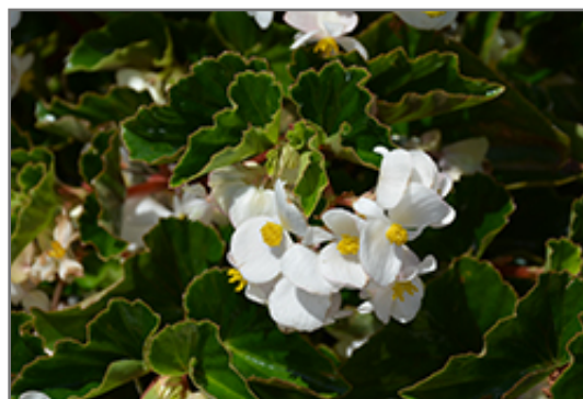
BabyWing White Begonia flowers