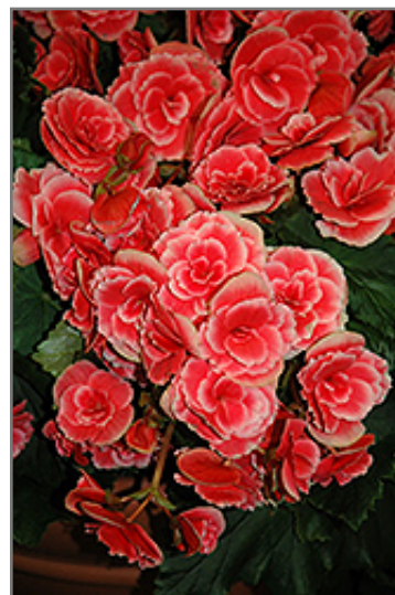
Borias Begonia flowers

Borias Begonia is recommended for the following landscape applications;