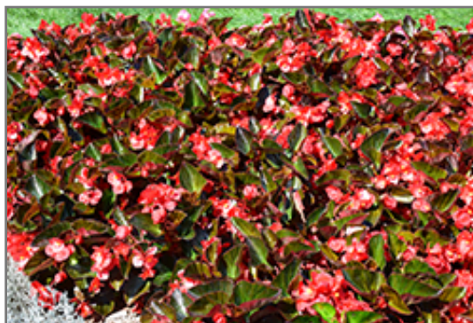
Big Red Bronze Leaf Begonia in bloom

Big Red Bronze Leaf Begonia is a fine choice for the garden, but it is also a good selection for planting in outdoor containers and hanging baskets. It is often used as a 'filler' in the 'spiller-thriller-filler' container combination, providing a mass of flowers and foliage against which the larger thriller plants stand out. Note that when growing plants in outdoor containers and baskets, they may require more frequent waterings than they would in the yard or garden.