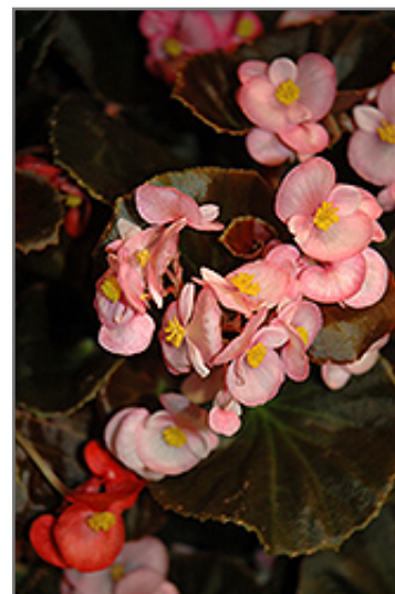
Nightife Pink Begonia flowers

This is a high maintenance plant that will require regular care and upkeep, and usually looks its best without pruning, although it will tolerate pruning. Deer don't particularly care for this plant and will usually leave it alone in favor of tastier treats. Gardeners should be aware of the following characteristic(s) that may warrant special consideration;