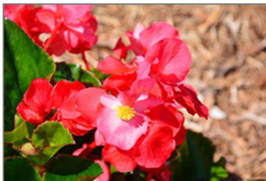
Whopper Rose Green Leaf Begonia flowers

This is a high maintenance plant that will require regular care and upkeep, and usually looks its best without pruning, although it will tolerate pruning. Deer don't particularly care for this plant and will usually leave it alone in favor of tastier treats. Gardeners should be aware of the following characteristic(s) that may warrant special consideration;