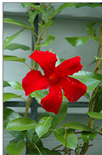
Sun Parasol Crimson Mandevilla flowers