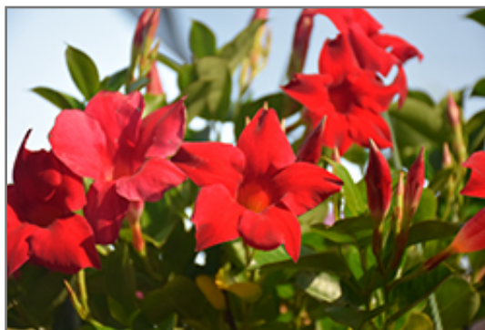
Sun Parasol Crimson Mandevilla flowers

This plant is native to the tropics and prefers growing in moist environments with evenly warm conditions all year round. In our climate, it is usually grown as an outdoor annual in the garden or in a container. If you want it to survive the winter, it can be brought in to the house and provided with special care, and then returned to the garden the following season. In its preferred tropical habitat, it can grow to be around 10 feet tall at maturity, with a spread of 24 inches. However, when grown as an annual or when overwintered indoors, it can be expected to perform differently, and its exact height and spread will depend on many factors; you may wish to consult with our experts as to how it might perform in your specific application and growing conditions.