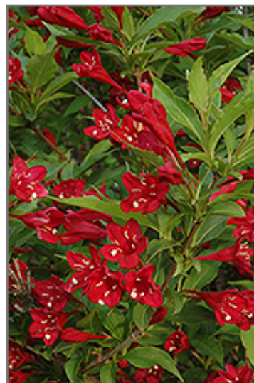
Red Prince Weigela flowers