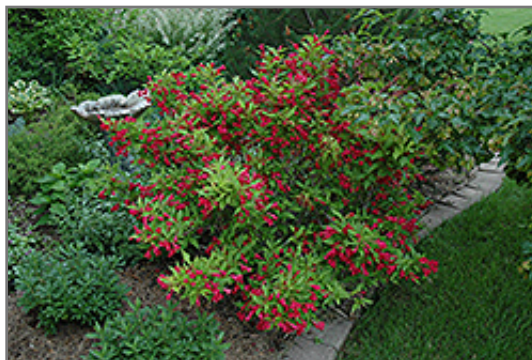
Red Prince Weigela in bloom