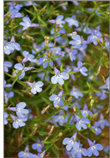
Techno Light Blue Lobelia flowers

Techno Light Blue Lobelia will grow to be about 8 inches tall at maturity, with a spread of 12 inches. When grown in masses or used as a bedding plant, individual plants should be spaced approximately 10 inches apart. Its foliage tends to remain low and dense right to the ground. Although it's not a true annual, this fast-growing plant can be expected to behave as an annual in our climate if left outdoors over the winter, usually needing replacement the following year. As such, gardeners should take into consideration that it will perform differently than it would in its native habitat.