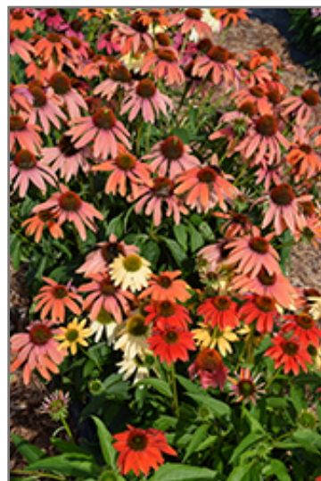
Cheyenne Spirit Coneflower in bloom

This is a relatively low maintenance plant, and is best cleaned up in early spring before it resumes active growth for the season. It is a good choice for attracting butterflies to your yard, but is not particularly attractive to deer who tend to leave it alone in favor of tastier treats. It has no significant negative characteristics.