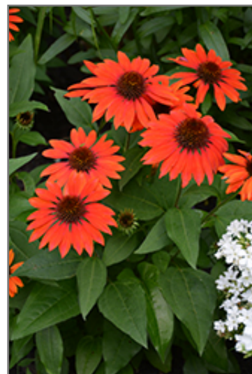
Sombrero Flamenco Orange Coneflower in bloom

Sombrero Flamenco Orange Coneflower is recommended for the following landscape applications;