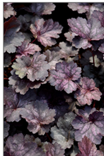
Glitter Coral Bells foliage