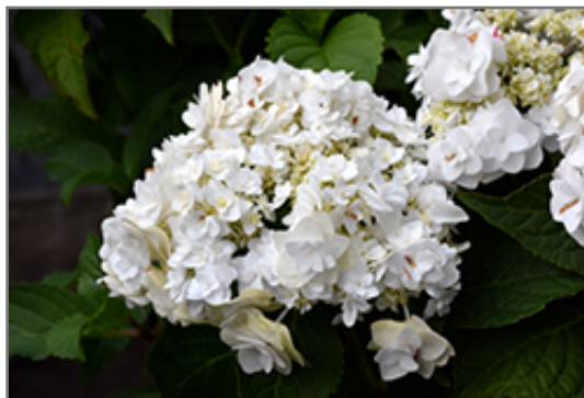
Wedding Gown Hydrangea flowers