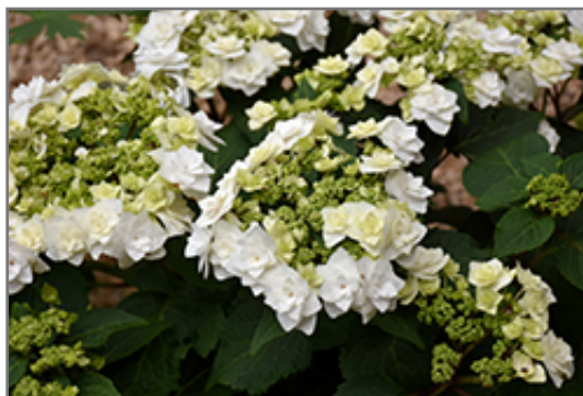
Wedding Gown Hydrangea flowers