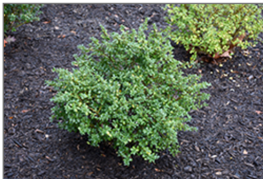
Green Lustre Japanese Holly