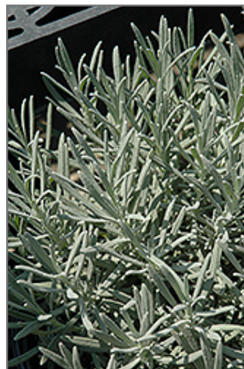
Phenomenal Lavender foliage

Phenomenal Lavender makes a fine choice for the outdoor landscape, but it is also well-suited for use in outdoor pots and containers. Because of its height, it is often used as a 'thriller' in the 'spiller-thriller-filler' container combination; plant it near the center of the pot, surrounded by smaller plants and those that spill over the edges. It is even sizeable enough that it can be grown alone in a suitable container. Note that when grown in a container, it may not perform exactly as indicated on the tag - this is to be expected. Also note that when growing plants in outdoor containers and baskets, they may require more frequent waterings than they would in the yard or garden.