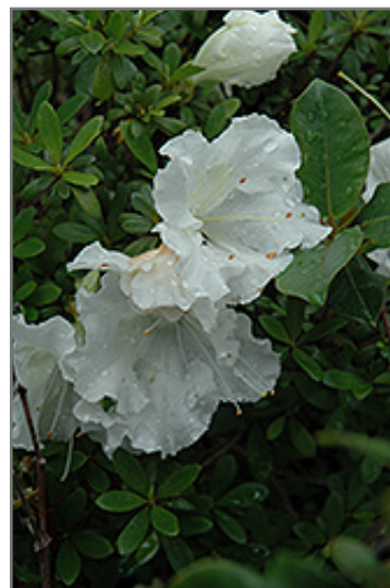
Gumpo White Azalea flowers

Gumpo White Azalea will grow to be about 24 inches tall at maturity, with a spread of 3 feet. It tends to be a little leggy, with a typical clearance of 1 foot from the ground. It grows at a slow rate, and under ideal conditions can be expected to live for 40 years or more.