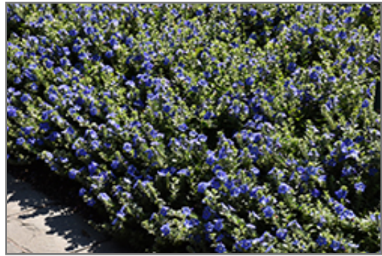
Blue My Mind Morning Glory in bloom

Blue My Mind Morning Glory is a fine choice for the garden, but it is also a good selection for planting in outdoor containers and hanging baskets. Because of its spreading habit of growth, it is ideally suited for use as a 'spiller' in the 'spiller-thriller-filler' container combination; plant it near the edges where it can spill gracefully over the pot. Note that when growing plants in outdoor containers and baskets, they may require more frequent waterings than they would in the yard or garden.