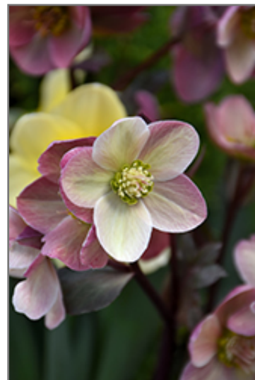
Pink Frost Hellebore flowers