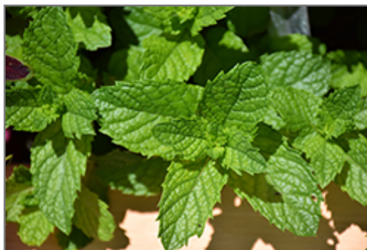
Mojito Mint foliage

Mojito Mint's attractive fragrant oval leaves remain green in color throughout the season on a plant with an upright spreading habit of growth.