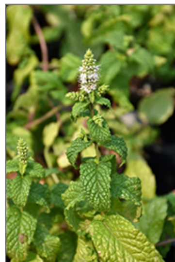
Mojito Mint foliage