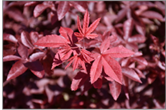
Rhode Island Red Japanese Maple foliage

Rhode Island Red Japanese Maple will grow to be about 12 feet tall at maturity, with a spread of 12 feet. It has a low canopy with a typical clearance of 3 feet from the ground, and is suitable for planting under power lines. It grows at a slow rate, and under ideal conditions can be expected to live for 80 years or more.