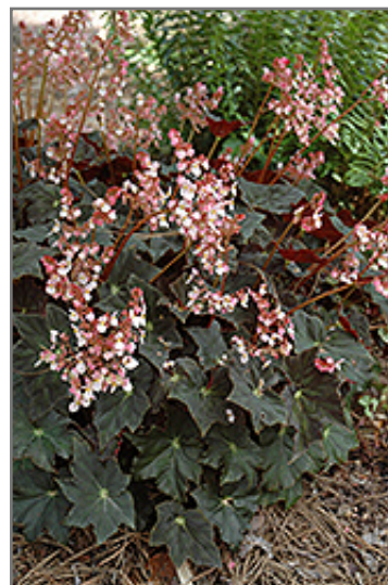
Joe Hayden Begonia flowers

Joe Hayden Begonia is recommended for the following landscape applications;