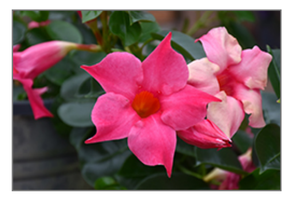
Pink Mandevilla flowers

This plant is native to the tropics and prefers growing in moist environments with evenly warm conditions all year round. In our climate, it is usually grown as an outdoor annual in the garden or in a container. If you want it to survive the winter, it can be brought in to the house and provided with special care, and then returned to the garden the following season. In its preferred tropical habitat, it can grow to be around 10 feet tall at maturity, with a spread of 24 inches. However, when grown as an annual or when overwintered indoors, it can be expected to perform differently, and its exact height and spread will depend on many factors; you may wish to consult with our experts as to how it might perform in your specific application and growing conditions.