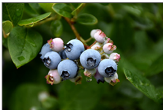
Elliott Blueberry fruit

Elliott Blueberry features dainty clusters of white bell-shaped flowers with shell pink overtones hanging below the branches in mid spring. It has green deciduous foliage. The glossy oval leaves turn yellow in fall. It features an abundance of magnificent blue berries from late summer to early fall. The smooth brick red bark adds an interesting dimension to the landscape.