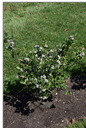
Elliott Blueberry fruit