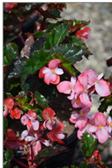
Richmond Begonia flowers

Richmond Begonia is recommended for the following landscape applications;