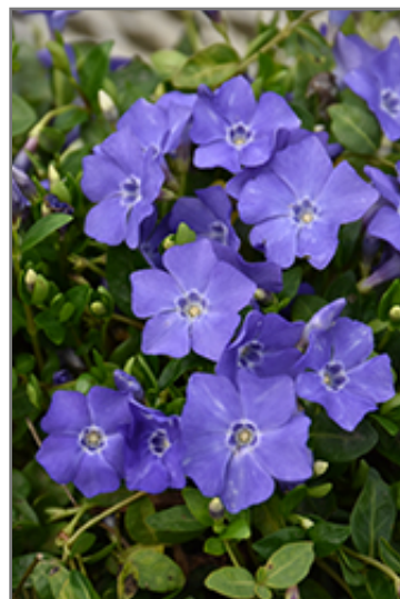
Bowles Periwinkle flowers

This is a high maintenance plant that will require regular care and upkeep, and should not require much pruning, except when necessary, such as to remove dieback. Deer don't particularly care for this plant and will usually leave it alone in favor of tastier treats. Gardeners should be aware of the following characteristic(s) that may warrant special consideration;