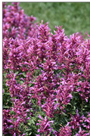
Rosie Posie Hyssop flowers

This is a relatively low maintenance plant, and is best cleaned up in early spring before it resumes active growth for the season. It is a good choice for attracting bees, butterflies and hummingbirds to your yard, but is not particularly attractive to deer who tend to leave it alone in favor of tastier treats. It has no significant negative characteristics.