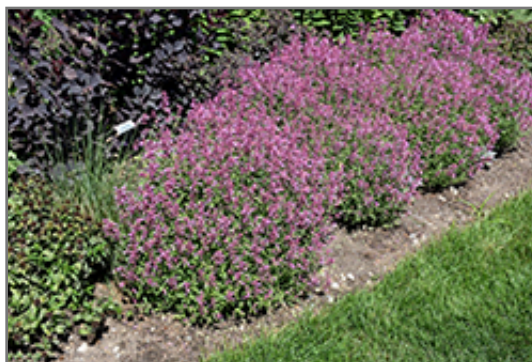
Rosie Posie Hyssop in bloom

Rosie Posie Hyssop will grow to be about 18 inches tall at maturity, with a spread of 32 inches. It grows at a fast rate, and under ideal conditions can be expected to live for approximately 6 years. As an herbaceous perennial, this plant will usually die back to the crown each winter, and will regrow from the base each spring. Be careful not to disturb the crown in late winter when it may not be readily seen!