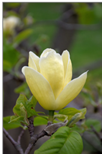
Lois Magnolia flowers