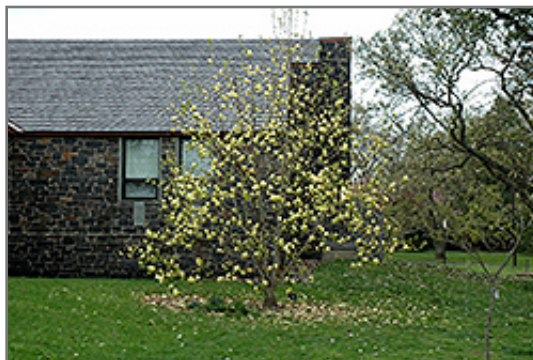
Lois Magnolia in bloom