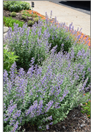
Purrsian Blue Catmint in bloom

Purrsian Blue Catmint is a fine choice for the garden, but it is also a good selection for planting in outdoor pots and containers. It is often used as a 'filler' in the 'spiller-thriller-filler' container combination, providing a mass of flowers against which the thriller plants stand out. Note that when growing plants in outdoor containers and baskets, they may require more frequent waterings than they would in the yard or garden.